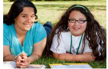
During back to school season and everyday, Sunny Hills' kids count on you!